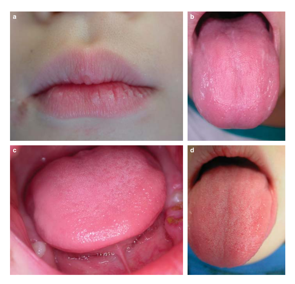
Figure 1. Clinical manifestations on examination of oral mucosa. (a) Dry and exfoliative lips. (b) Dryness and papillary atrophy on the dorsum of the tongue. (c) Reduced saliva secretion on mouth floor. (d) Recovey of papillae on the dorsum of the tongue after antifungal treatment.

intravenous injection of Tc-99m, and imaging was obtained at 5, 10, 20, 30, and 40 min after the injection. Ascorbic acid was administered topically in the mouth as a stimulant of salivary secretion 30 min after injection. There was no uptake bilaterally of the major salivary gland spaces, measured at multiple time points by scintigraphy. This established the diagnosis of congenital agenesis of all major salivary glands.