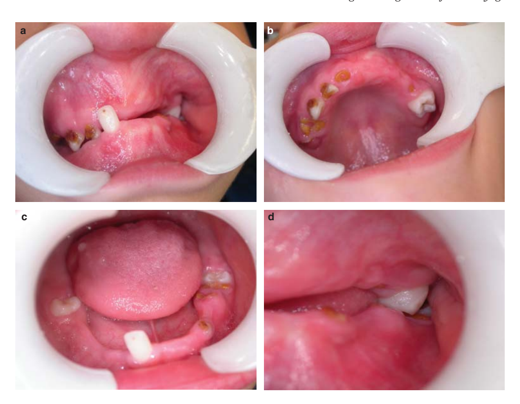
Figure 2. Clinical manifestations on dental examination. (a) Anterior teeth on close bite. (b) Upper teeth missing, residual roots and caries. (c) Lower teeth missing, residual roots, and caries. (d) Relation of posterior teeth on close bite.

lacrimal puncta. Only 14 reported cases of congenital major salivary gland agenesis with lacrimal abnormalities could be found in the literature (Table I) [1–11]. In 1925, Blackmar [2] reported the first case of an 11-year-old girl with congenital absence of the lacrimal puncta associated with an absence of salivary glands. Smith and Smith [3] reviewed 16 cases (11 in living patients) of congenital absence of all four salivary glands in 1977, and found that 3 of the 11 were associated with defects of the lacrimal apparatus.