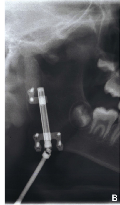
Fig. 1. Operative procedures.