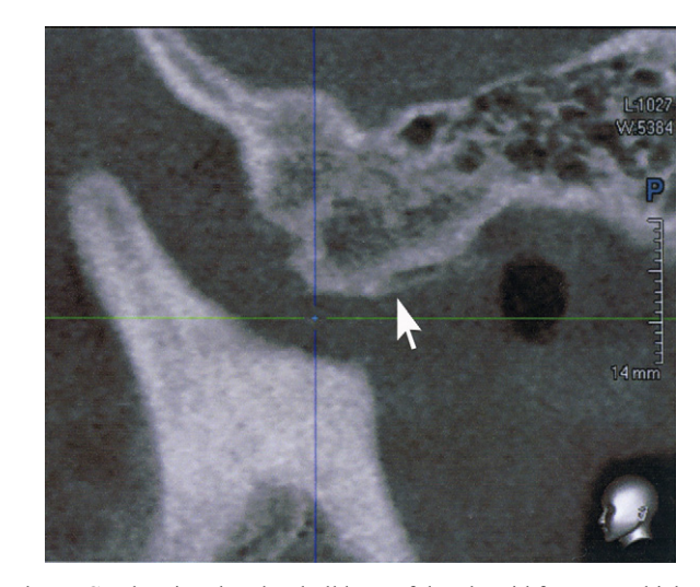
Fig. 4. Cone beam CT showing that the skull base of the glenoid fossa was thickened, the fossa shape had disappeared and a prominent bone mass (arrow) was located in the glenoid fossa next to the residual ramus.

The amount of condylar resorption was not obvious in the panoramic radiographs of 3 patients. This result was confirmed by the cone beam CT images; Fig. 3 shows the slight resorption of a reconstructed condyle. In 4 patients, the panoramic radiographs showed that the reconstructed condyles were obviously resorbed. This result was also confirmed by cone beam CT images; Fig. 4 shows the severe resorption of reconstructed condyles.