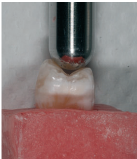
Figure 2 The fracture resistance test.

The teeth were stored in distilled water for 1 week to allow the endodontic sealer to set completely. Fracture resistance was tested as described by Reeh et al. (1989) and Mondelli et al. (2009). The teeth were mounted in a customized fixture and subjected to axial compressive loading with cross-head speed of 0.5 \text{ mm min}^{-1} (Model 3367; Instron, Canton, MA, USA). The vertical loading force was applied through an 8 mm-diameter stainless steel ball parallel to the tooth axis. The contact points were approximately half way up the cusp triangular ridge (Fig. 2). Fracture resistance was recorded at the peak of the load-displacement curve. In addition, the fracture patterns were recorded using a simplified classification of cracked tooth syndrome proposed by the American Association of Endodontics (2008). The fracture patterns recorded were type 1 fracture – fractured cusp – which may extend to the cervical third of the crown or root (restorable) and type 2 fracture – fractured tooth – which includes cracked tooth and split tooth (nonrestorable). Fracture resistance of premolars between the five groups was compared using the ANOVA/Fisher's LSD test. Fracture patterns of the five groups were analysed with the Pearson chi-square test. Pairwise comparison was carried out to calculate the odds ratio. The significance level was set at 0.05.